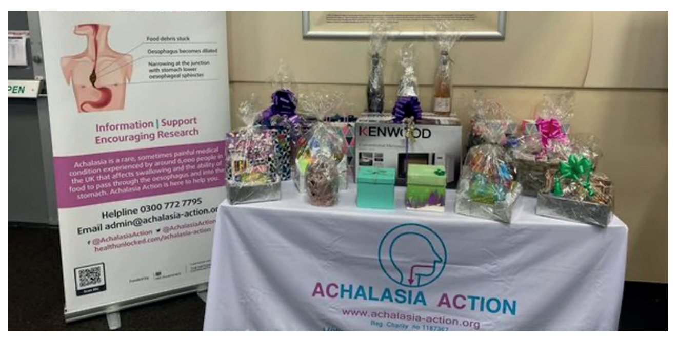
The display at Curry's Mansfield for achalasia awareness week